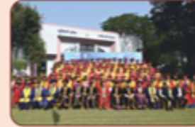
Hon' Shri Gyanesh Kumar, IAS Hon' Secretary, Ministry of Cooperation, Govt. of India Convocation - PGDM-ABM 2021-23 batch