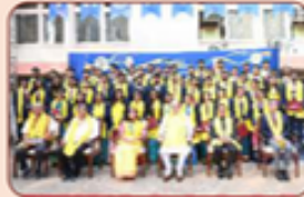
Hon' Shri Amit Shah Home Minister & Minister of Cooperation, Govt. of India Convocation - PGDM-ABM 2019-21 batch