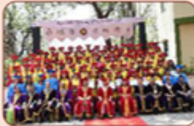
Hon' Shri B.L. Verma State Minister, Ministry of Cooperation, Govt. of India Convocation - PGDM-ABM 2021-23 batch