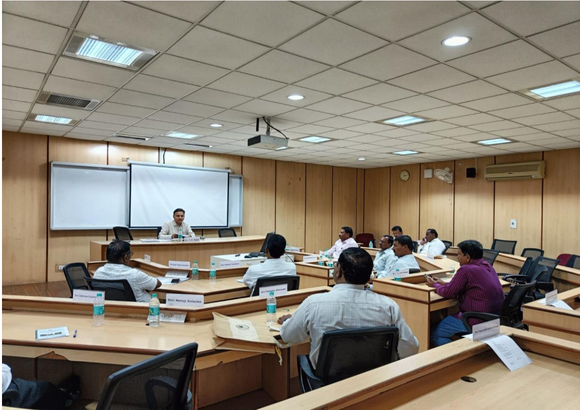
Valediction of the programme