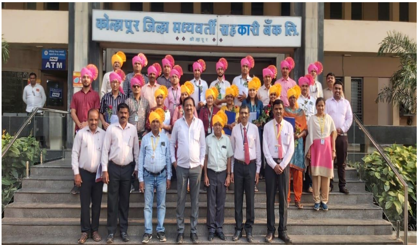
Exposure visit of the 55 th Batch PGDCBM participants to Kolhapur District Central Cooperative Bank Ltd, Kolhapur