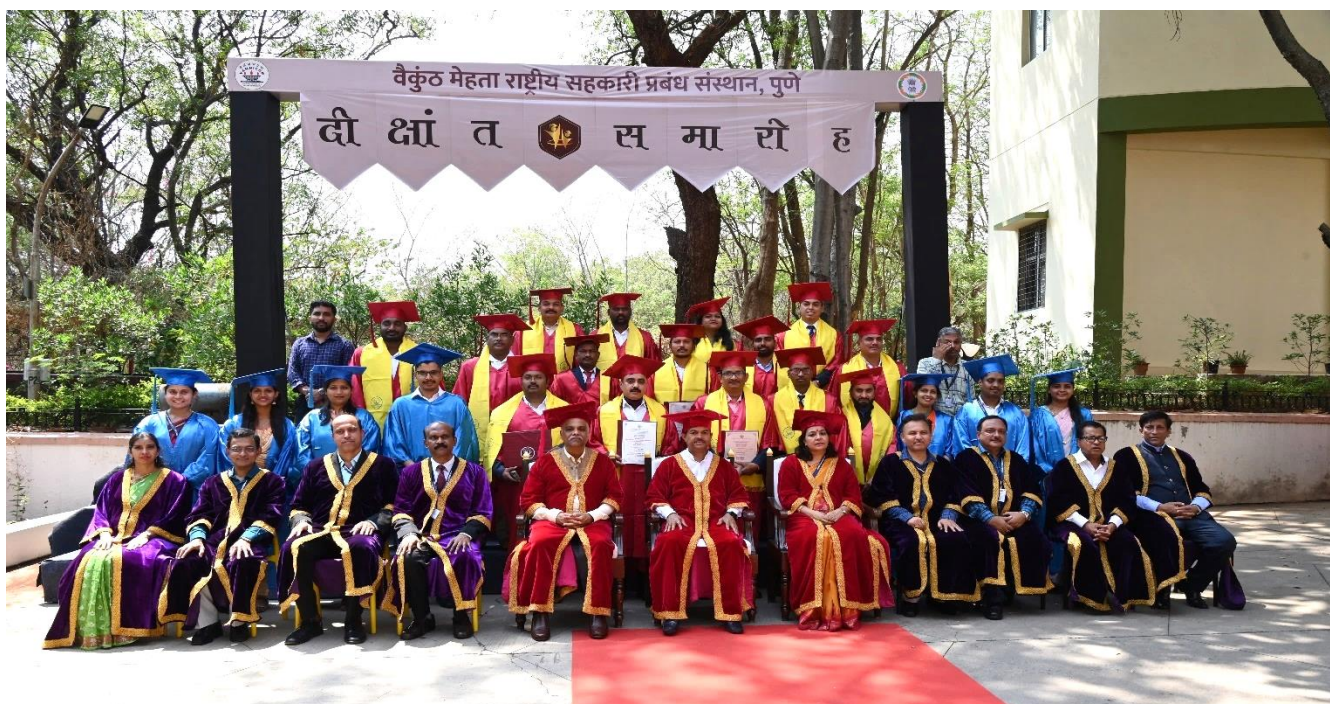
(Annual Convocation 2023 -55 th & 56 th Batch PGDCBM )

Group photo of the rank holders of PGDM-ABM 2019-21 batch and 53rd & 54th PGDCBM participants and faculty members of VAMNICOM along with Shri Amit Shah, Hon'ble Minister of Home Affairs and Cooperation, GOI