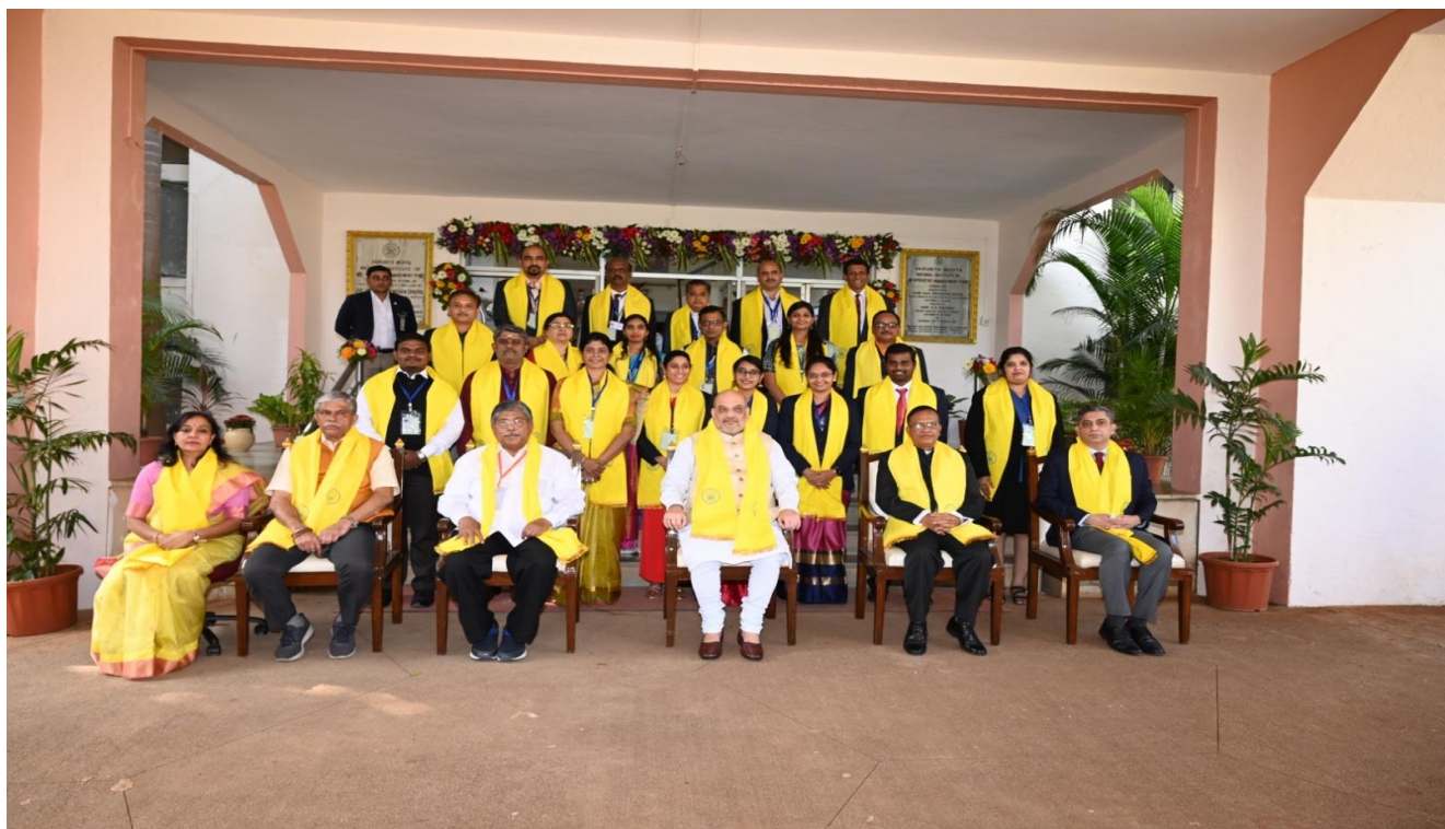
(Annual Convocation 2021-53 rd & 54 th Batch PGDCBM –Rank Holder)

Group photo of the rank holders of PGDM-ABM 2019-21 batch and 53rd & 54th PGDCBM participants and faculty members of VAMNICOM along with Shri Amit Shah, Hon'ble Minister of Home Affairs and Cooperation, GOI