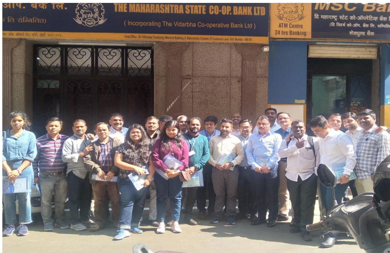
Exposure visit of the 56 th Batch PGDCBM participants to Maharashtra State Cooperative Bank Ltd.