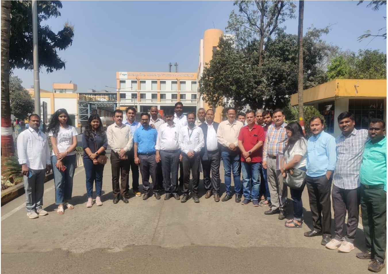
Exposure visit of the 56 th Batch PGDCBM participants to WARANA