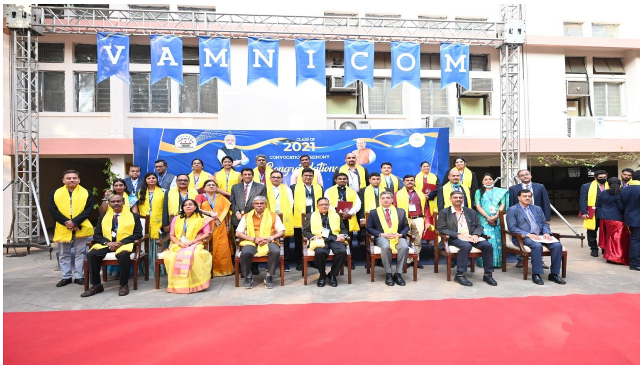
(Annual Convocation 2021- 53 rd & 54 th Batch PGDCBM Participants )