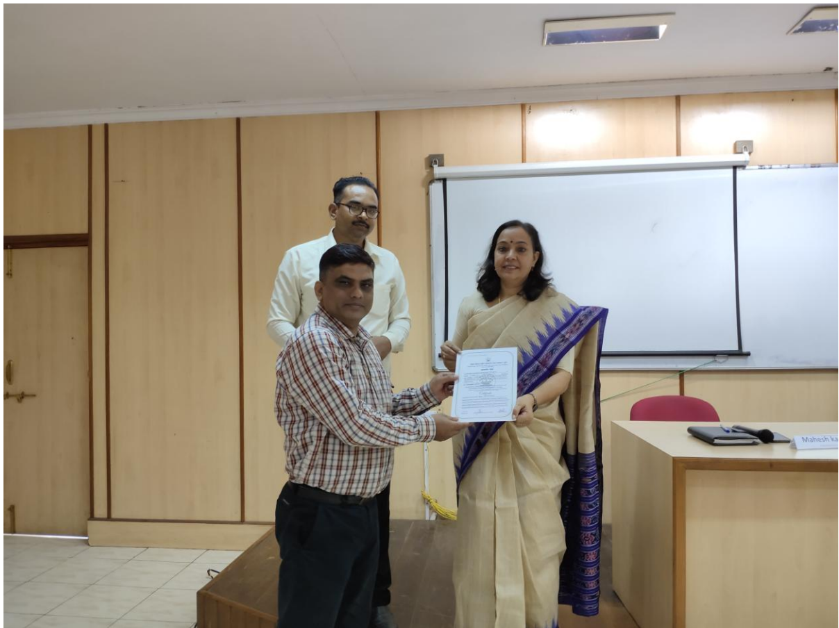
Certificate distribution to successful completion of the training programme under DGR on dated 25.11.2022 by Director, VAMNICOM Pune